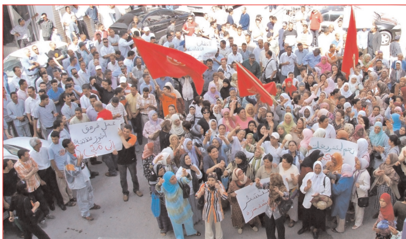
Above: protesting working hours in a street demonstration in Tunis