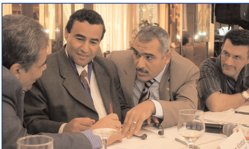
Below: role-playing negotiations during the Cairo seminar for broadcast unions

Without collective bargaining there is no trade union activity, Amman-based Bilal Milkawi from the International Transport Workers Federation told Graphical unions.