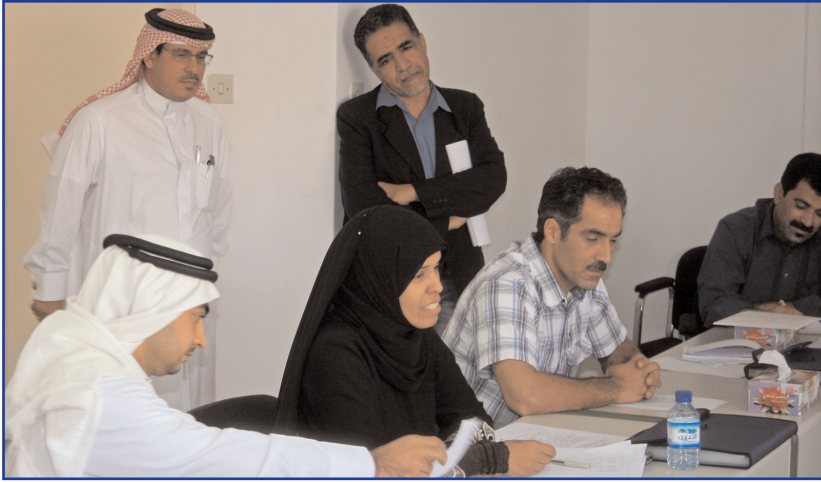
Bargaining role-play at GFBTU offices in Bahrain