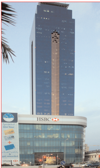
Familiar faces moving into the region