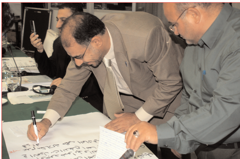
Finalising the workshop flipchart during the Graphical seminar in Amman