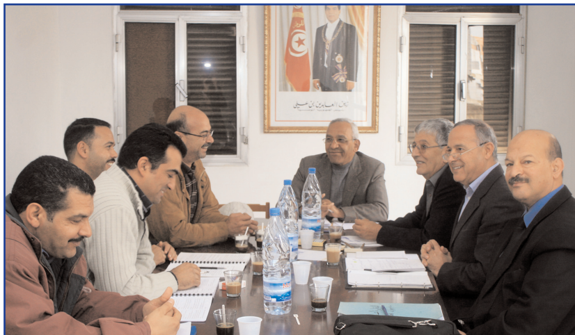
Tripartite collective bargaining in Tunisia (Graphical)