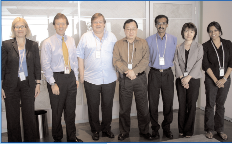
Senior HSBC staff with UNI-Asia Pacific in Hong Kong in June