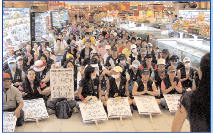
Fighting for their jobs - sitting in at an E-Land store in Korea

In South Korea commerce workers in KCTU occupied E.Land stores to fight for 1,000 part time and contract workers who lost their jobs just before new laws that would have made their transition to full time jobs easier. The sackings went ahead in spite of a Labour Commission ruling of unfair dismissal. E.Land took over Carrefour Korea with employment guarantees. Union officials have already been threatened with arrest. UNI is calling for immediate re-instatement. (uni-asiapacific@uniglobalunion.org)