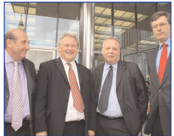
Above: Members of the UNI Finance group after their meeting with the Barclays' Chief Executive

International Justice Day, held on 15 June, was a great success with activities in 43 cities and 17 countries. Rallies, marches, petitions and celebrations got across the message for workplace justice for cleaners and security guards. 300 cleaners in the DR Congo made TV with a call to "fight for health and well-being". In Belgium security guards stopped work, forcing flight cancellations and proving the essential role of property service workers. (internationaljusticeday.org)