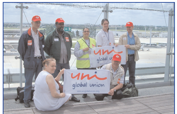
Below: Orly airport workers France demand justice for cleaners and security guards